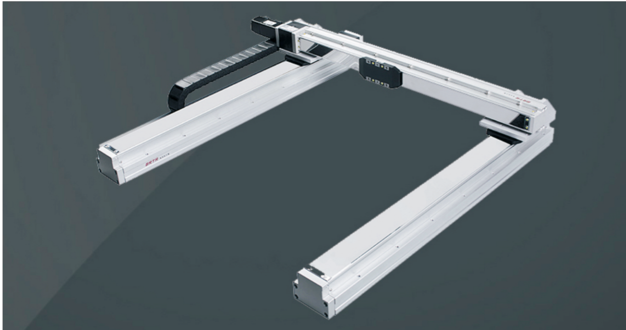
此图仅供参考, 出货规格详见尺寸图画 The picture is just for the reference. Please check the actual dimensions on the drawing.